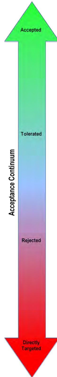
Figure 2: Acceptance Continuum 5

Of all levels, the “tolerate” level is perhaps the most tenuous because it could tip toward welcome as easily as it could tip toward rejection. Nevertheless, external events, an NGO’s